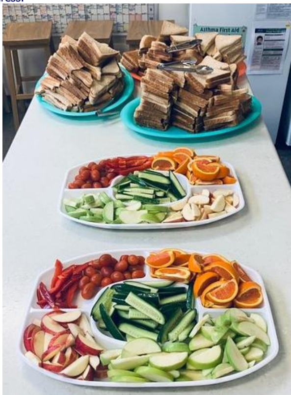
Yet another beautiful afternoon tea at OSHC!

Please be reminded that ALL notifications of absence, general correspondence and enquiries should be sent to eppingheightsoosh@hotmail.com Our administration company 'Becklyn' often receive emails from our families that should be sent to the centre. We can't guarantee that the information you send to Becklyn will be forwarded to the centre in time for cut-off periods relating particularly to notifications of absence. In these instances, you may be charged a non-notification fee if you have sent your email to the incorrect address.