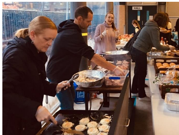
Father's Day Breakfast... what a hit!

gives our families and educators the opportunity to socialise. EHOSHC has also taken on the school Father's Day breakfast, hosted a community tree planting event and are looking forward to putting into place a whole lot more to help foster a close-knit community. Our service is very lucky to be in a position where we can work closely with our families and wider community to build a trusting, happy and safe environment which benefits everyone. EHOSHC acts as a hub of community support for our families, and it is a wonderfully rewarding part of our job as educators to see and 'feel' this community closeness growing.