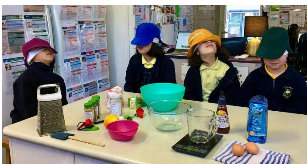
Masa's famous blind-mindful-cooking adventures!

We have recently introduced our new touchscreen system. It is a web-based system that we are pleased to say everyone has gotten used to very quickly! Please ensure you signal to one of our team if you are not sure as to whether you have correctly signed in or out. Please also be reminded to ensure you are using your correct login which is unique to you, as our rolls must be accurate.