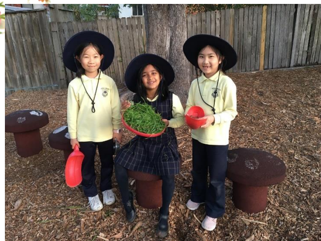
A frisbee full of grass is worth two in the bush...

We have recently conducted our annual OSHC family survey. The information we gather from such surveys is important for our team to ascertain the needs, wants and requirements of our community. Please look out for the publishing of the survey results and how we intend to move forward in light of our findings.