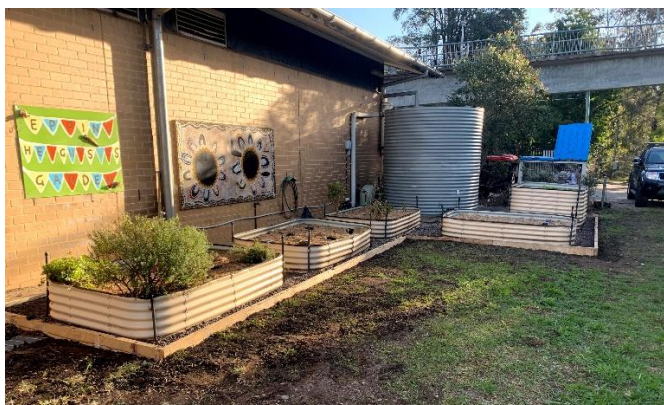
The Garden looking fabulous!

Thank you to our educators, Zoe and Mia who are in charge of all things "garden".