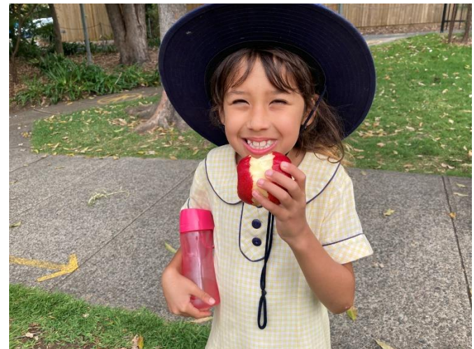
Scarlett enjoying a snack